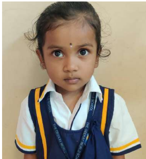
Mahaamirthavalli - K1 Kiwi