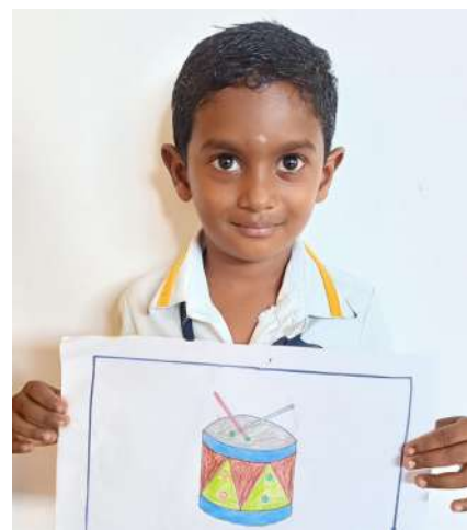
Tenith K3 Litchi