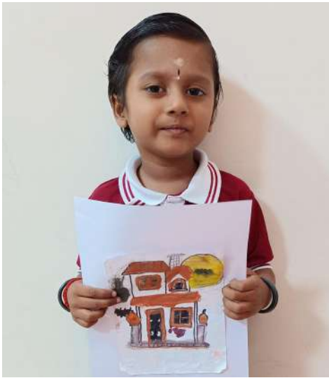
Perisai K2 Kiwi